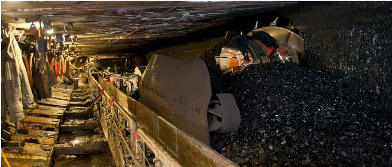
Underground view of an active coal mine

Although there is a tremendous amount of focus on the shale oil and gas developments in the OMEGA District, coal mining still plays a large role in the region. Pictured above, Murray Energy Corporation is headquartered in St. Clairsville in Belmont County. Murray Energy Corporation is the largest privately owned coal company in the United States, producing sixty-five million tons of high quality bituminous coal each year, and employing over 7,400 people in six states. Murray Energy has approximately three billion tons of coal reserves. On December 5, 2013, Murray Energy purchased Consolidation Coal Company from CONSOL Energy, Inc. This was a transformative transaction for Murray Energy.